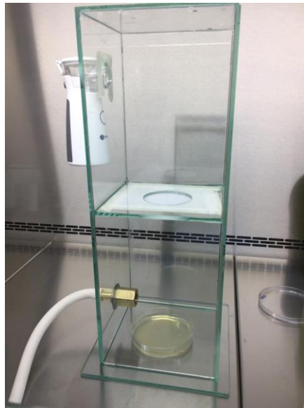
Figure 2. The image of the apparatus developed for Bacteria Filtration Test